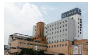
Daejeon St. Mary's Hospital (663 beds)

93 Jungbu-daero, Paldal-gu, Suwon-si, Gyeonggi-do