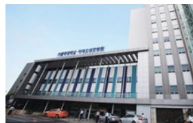
Yeouido St. Mary's Hospital (535 beds)