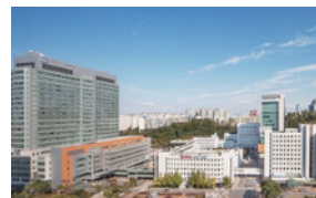
Seoul St. Mary's Hospital (1,375 beds)