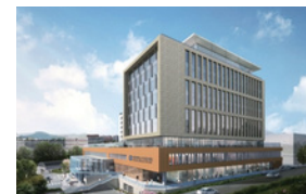
Bucheon St. Mary's Hospital (662 beds)

271 Cheonbo-ro, Uijeongbu-si, Gyeonggi-do